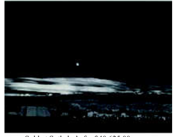
Sold at Sotheby's for $40,625.00