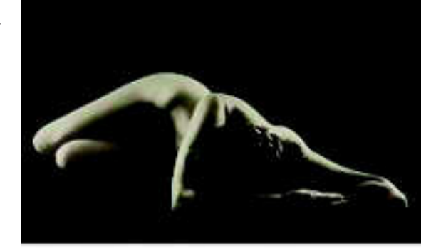
Sold at Sotheby's for $13,750.00